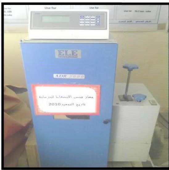
Figure (2).ELE international testing machine.

The compressive strength of the different specimens was measured using the international testing machine shown in Figures (2) and (3) respectively, where the specimen was compressed between the upper and lower hubs of the machine until fracture of the specimen had occurred. The uncertainty average of the used machine was ( \pm 0.1\% ).