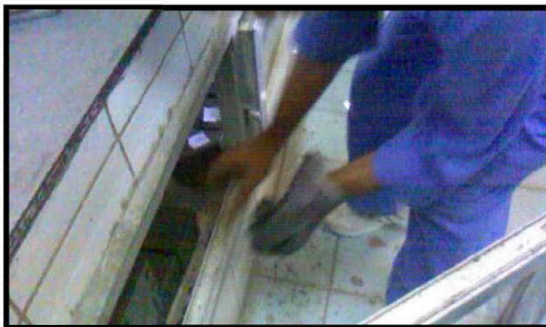
Figure ( 7 ).The optimum conditions box.

Finally, after pull out the specimen mold from the vibrating device, it is putted in an optimum condition box as shown in Figure (7) with specified condition (dry bulb Temperature = 21.4^{\circ}\text{C} & relative humidity = 88% ), to reach the maturation case (7days). Figure (8) shows the specimens after the process.