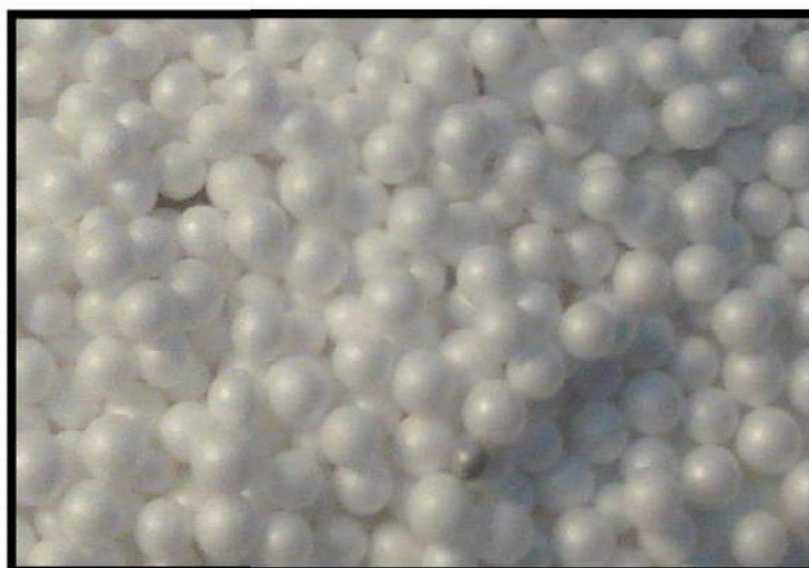
Figure (4). Granules of polystyrene.

Table (1) shows the weight of each material that the concrete specimen consist of and its percentage was.