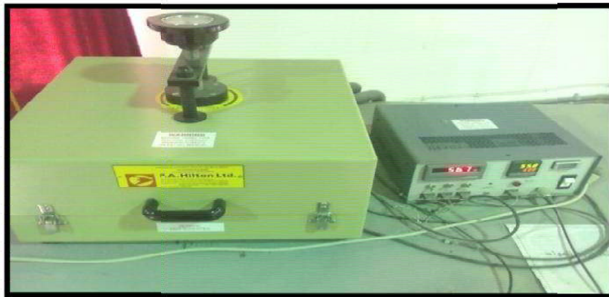
Figure (1). Hilton B480 instrument for measuring thermal conductivity of buildings & insulating materials.

The Hilton B480 Thermal Conductivity of Buildings & Insulating Materials Unit instrument shown in Figure (1) was used to measure the thermal conductivity of the different manufactured specimens. The apparatus consists mainly of an insulated fiberglass hinged enclosure. The base section of the closure contains the heat flow meter and the cold plate assembly which mounted on four springs. The plate is cooled with water to maintain it at constant temperature. The enclosure lid houses the electrically heated hot plate, which is electronically controlled for setting the required temperature. A computerized system is used to determine and display the measured values of thermal conductivity.