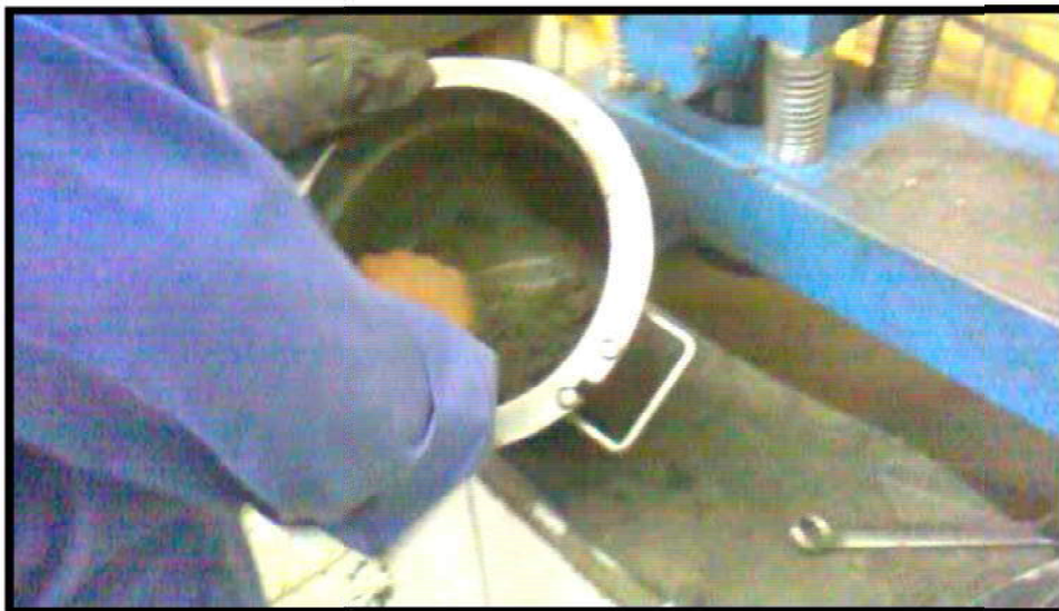
Figure ( 5). The mixing process.

The experimental work of the project was carried out in the laboratories of engineering college of Karbalaa university begin with the specimens making process. Mixing process was done by putting the cement and sand then they mixed manually properly , finally the mixture is made by adding the water with overturning it to have a homogenous mixture for four minutes as mentioned in the Iraqi standardization, as shown in Figure (5). In case of adding the insulation the cement , sand and the specified percentage of the granule of insulation (polystyrene) are putted and then mixed manually for the same period.