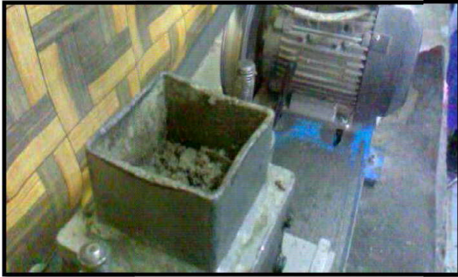
Figure ( 6 ). The Vibrating machine.

Vibrating machine device is also used to ensure a good distribution of the mixture in the mold and expel the air (Figure (6)).