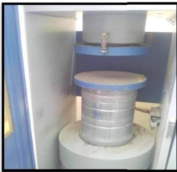
Figure (3).The hubs of ELE international testing machine.