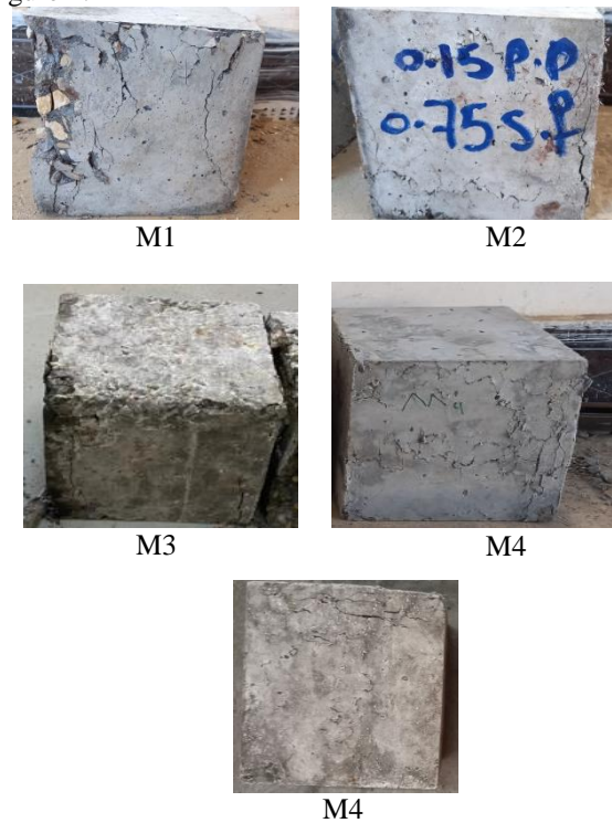
Figure. 2 cubes after failure

The compressive strength of 150x150x150 mm cube sample was determined using BS 1881: Part 5 [11]. These samples were tested under compression testing machine, with capacity 2000 kN. The strength of compressive was calculated using the three specimens' average values. The failure form of the compressive strength test is shown in Figure 2.