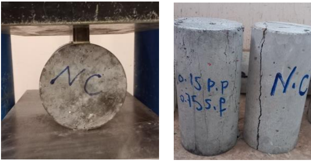
Figure. 3 Splitting tensile test